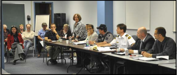
Post event debriefing and discussion with all engaged BGH departments and community partners

“We hosted a mock Code Orange (external disaster) to test our systems,” explains Wheeler. “It’s a proactive measure in case this city ever really faced a major situation.”