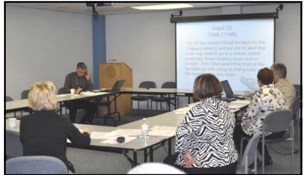
BGH Command Centre during the Mock Code Orange.

The exercise involved other services that would respond in such an event, including the Brockville Fire Department, the Brockville Police Department and paramedic services. It also relied on the dramatic services of 24 BCI students to provide injuries and casualties.